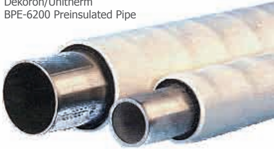
Dekoron/Unitherm BPE-6200 Preinsulated Pipe