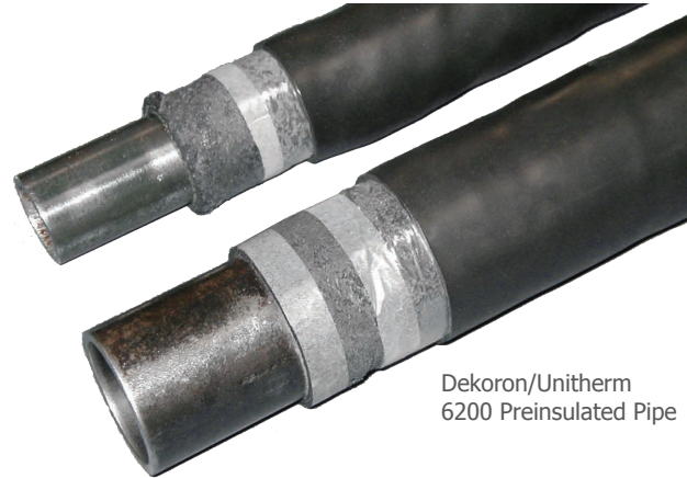
Dekoron/Unitherm 6200 Preinsulated Pipe